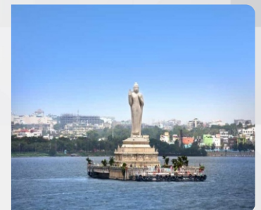
HUSSAIN SAGAR LAKE