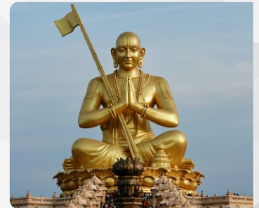
STATUE OF EQUALITY